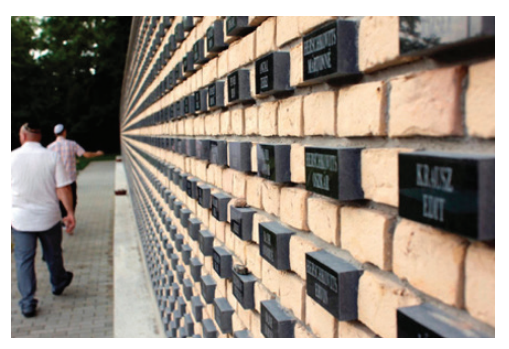
The monument wall in Békéscsaba

Support needs to be allocated to the communities who are "weakened by force" for the creation of monuments, the refurbishment of synagogues and cemeteries. Finally, there must be zero tolerance for the incitement of hatred and discrimination. The latter is now the rule of law and the new civil and criminal code.