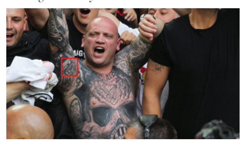
Hungarian football supporter wearing swastika tattoo in Bordeaux

At The UEFA Euro 2016 Championship organized in France, pictures were taken of two supporters which show a swastika tattoo on their arm, and these pictures appeared in several European newspapers. The first picture was taken in Bordeaux on the 14th of June and the other picture was taken of the supporter at the game in Lyon on the 22nd of June.