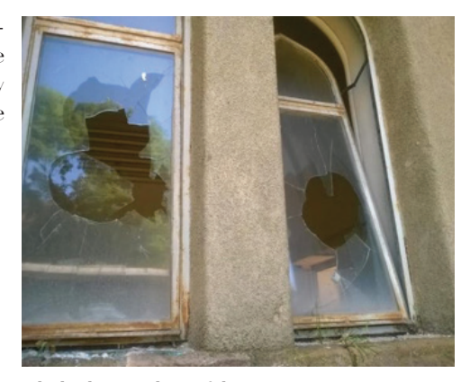
The broken windows of the Synagogue in Gyöngyös