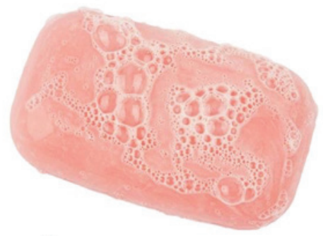
Én így szeretlek!

The phote on the Facebook profile "Háborús bűnös"