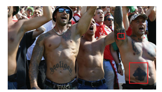
Football supporter wearing tattoos of swastika and Arrow-Cross in Lyon