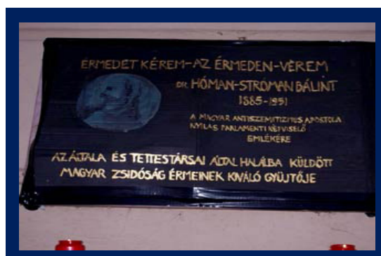
The old and the new Hóman memory plaque