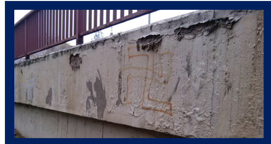
The left-facing swastika near Faraktár street

One of our coworkers contacted the notary of Debrecen to have the swastikas removed.