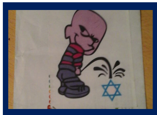
The anti-Semitic sticker, Source: Forum against anti-Semitism

Forum against anti-Semitism posted an image on their Facebook profile showing a company envelope with a sticker on it. The sticker depicts a bald boy, with an evil smile, urinating on the Star of David.